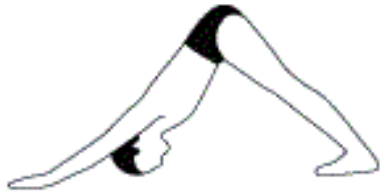
Adho Mukha Svanasana