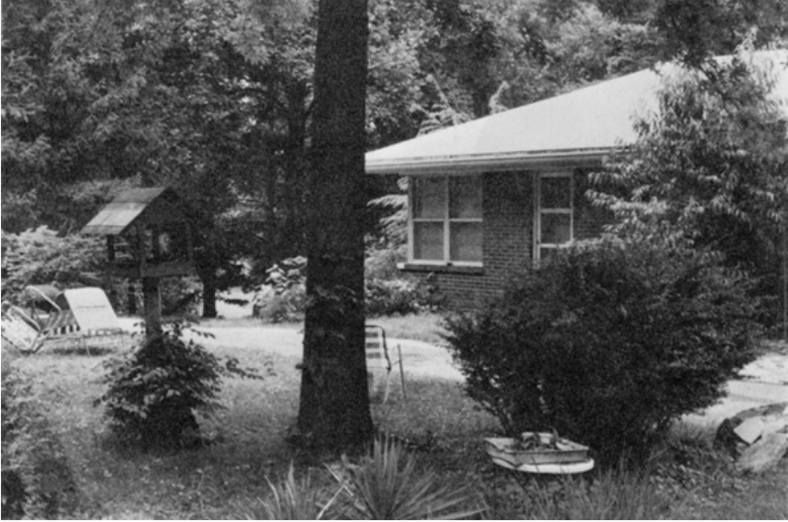
The exterior of the Ra room: the door and corner windows are part of the outside of the room in which the Ra sessions have taken place since January 1981. ( Photo taken June 9, 1982. )