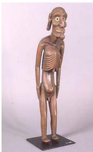
Figure of Moai Kavakava ancestor

Collections Online ◀ Ethnological Missionary Museum ◀ Oceania ◀ Polynesia